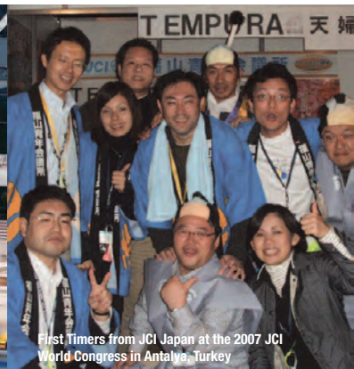
First Timers from JCI Japan at the 2007 JCI World Congress in Antalya, Turkey